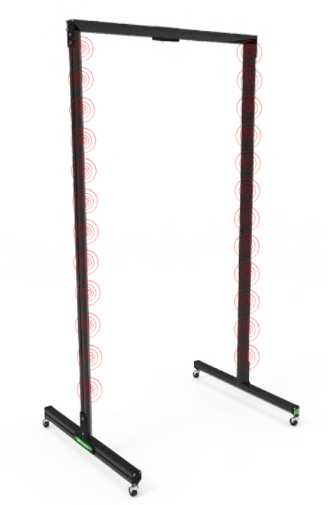
Portable Model: $6,900 USD

ThermalPass Portable is built for easy assembly and mobility