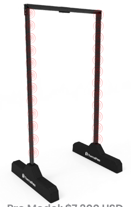
Pro Model: $7,300 USD

ThermalPass Portable is built for easy assembly and mobility